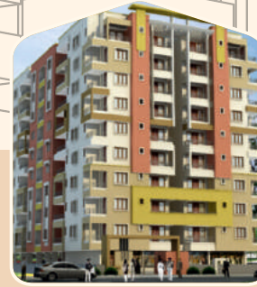
आर्ची अरिहंत शोभागपुरा