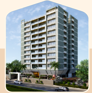
आर्ची सॉल्लिटेयर हिरण मगरी, सेक्टर - 14

DEVELOPER ARCHI ARIHANT (A Unit of Archi Group of Builders)