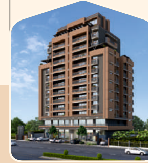
आर्ची डिवाइन हिरण मगरी, सेक्टर - 4