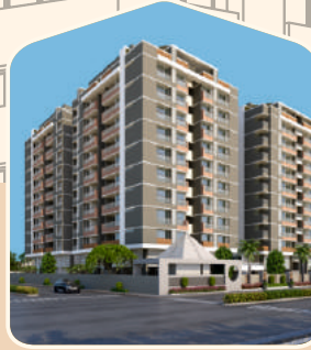
आर्ची पीस पार्क हिरण मगरी, सेक्टर - 3