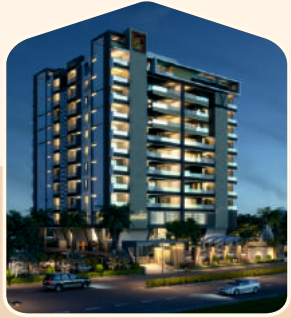
JS आर्ची प्लैटिनम सुखाड़िया सर्किल, पंचवटी